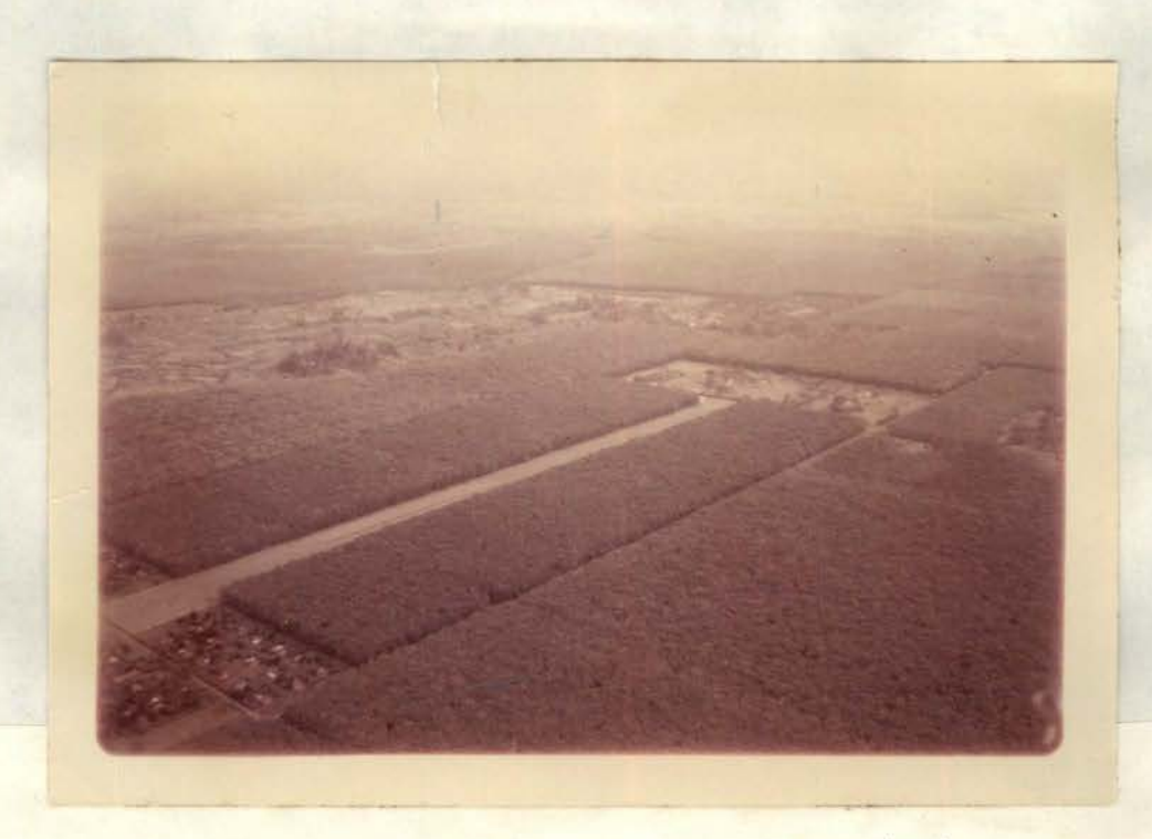
Figure 3. An Loc Pickup Zone (PZ)