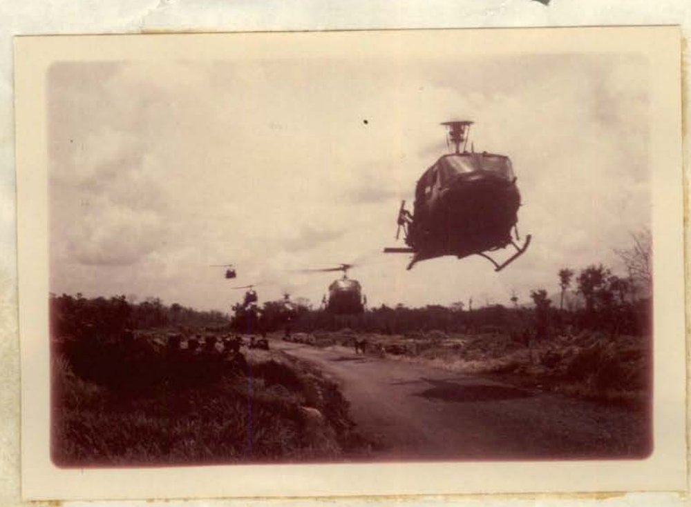
Figure 7. LZ YANKEE