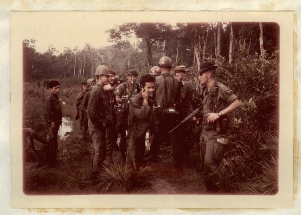
Figure 9. Advisors and counterparts of Task Force Ranger on Operation TOLEDO