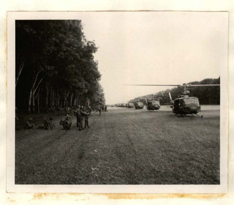
Figure 4. Rangers on An Loc PZ