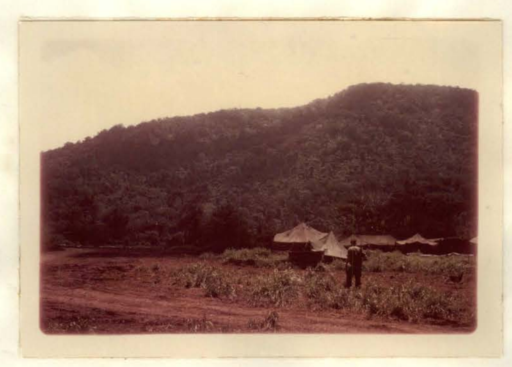
Figure 5. Position CASTILE, Headquarters 173d Airborne Brigade