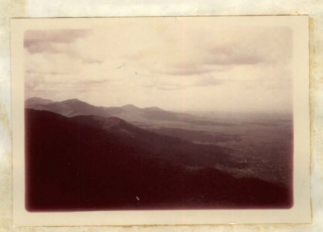
Figure 8. Mao Tao Secret Zone (Area of Operations)